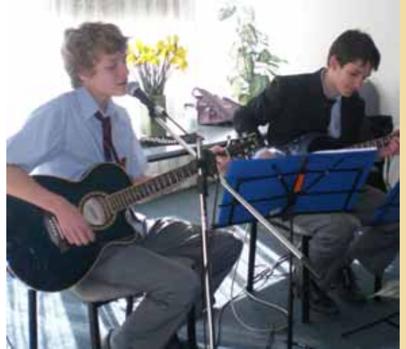
St Edwards Students performing at the Homeless Persons' Memorial Service in the Donnison Street Community Centre

Well done to all of those of you who contributed in some way!!