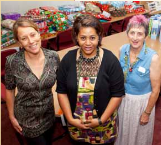
Volunteers sorting presents on Christmas Day 2009

Christmas at Coast Shelter is shaping up to be wonderful thanks to the generosity of the Central Coast community. Everyone is giving what they can to ensure that those experiencing hardship, also have an enjoyable time.