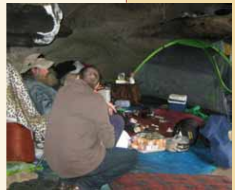
Left: Penny visiting the caves

From this experience, Coast Shelter was amazed with the dignity they displayed and the special bond they shared. When we were invited to visit their caves, they were proud to show us what they had, even referring to the biggest cave as “Buckingham Palace”.