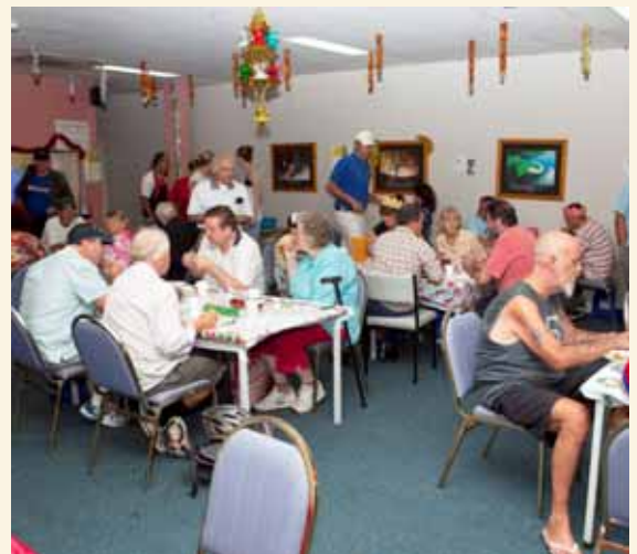
Guests enjoying lunch on Christmas Day in the Donnison Street Community Centre 2009

Coast Shelter also makes sure that each one of our clients and guests receive a gift on Christmas Day. This is made possible thanks to a host of individuals and groups who donate presents leading up