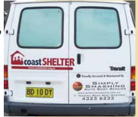
Coast Shelter’s refrigerated van which is serviced and maintained by Simply Smashing