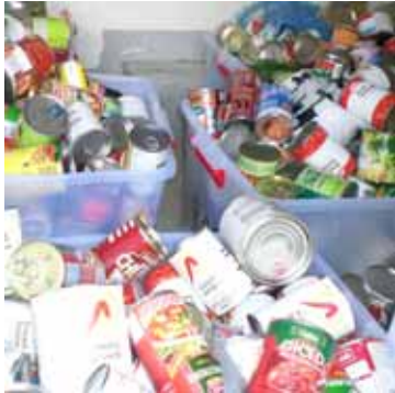
A fantastic effort from Green Point Christian College